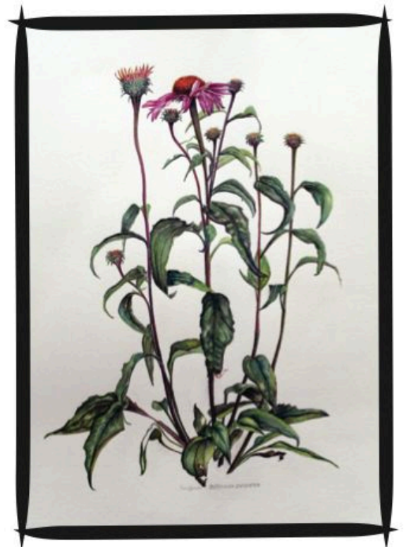
Second Place Untitled by: Susan Lofthouse