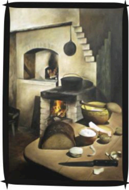
"Old Country Kitchen" by: Gracia Bovis