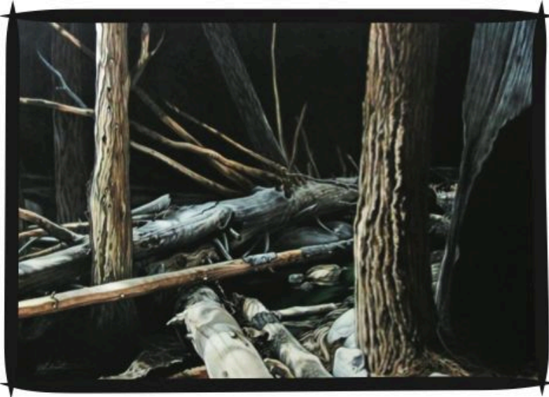
First Place & Popular Choice "Old Guard" by: Joe Christensen

Images are owned by the artists, and may not be copied or used in any way without the permission of the artist.