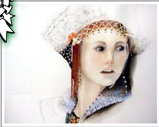
Popular Choice and 3rd Place by Par Barr (no title)