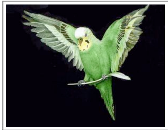
Honorable Mention by Charles Bettencourt (no title)