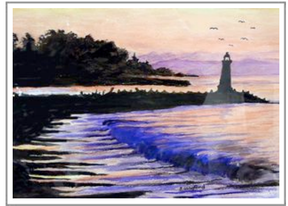
Popular Choice "CA Sunset" by Sue Langford