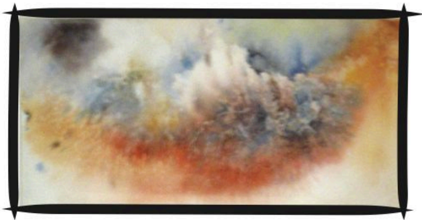
Popular Choice by: Pat Barr