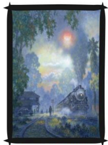
Honorable Mention by: Fred Sinclair