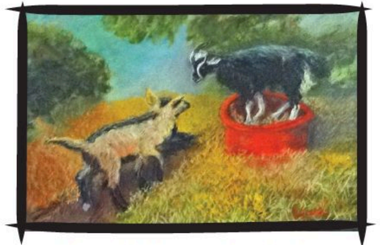
Honorable Mention & Popular Choice by: Pat Knowles