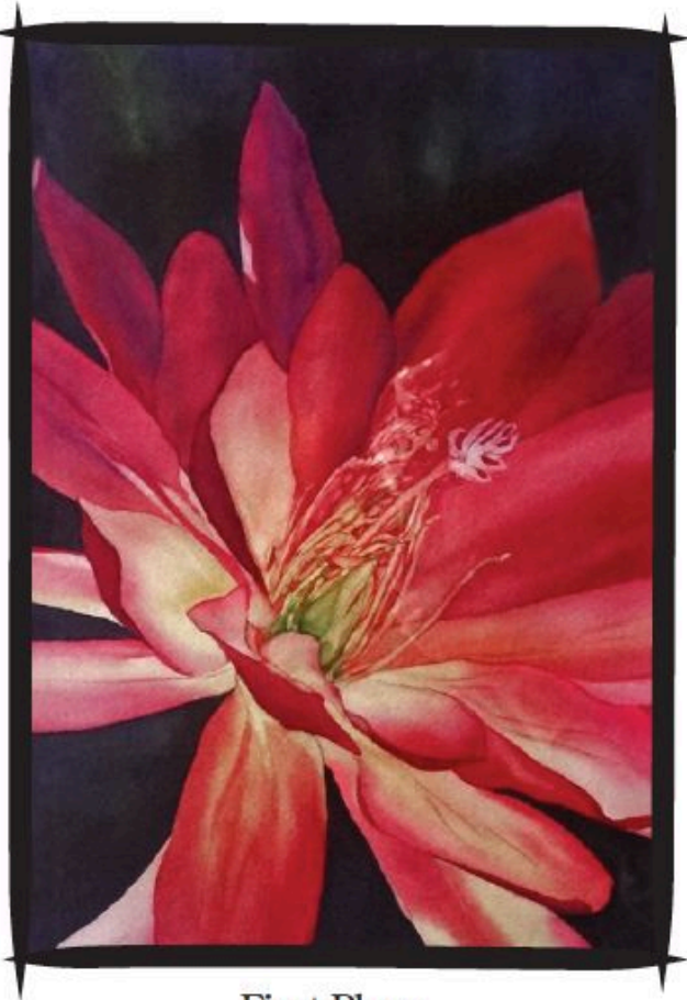
First Place by: Carmel Adams