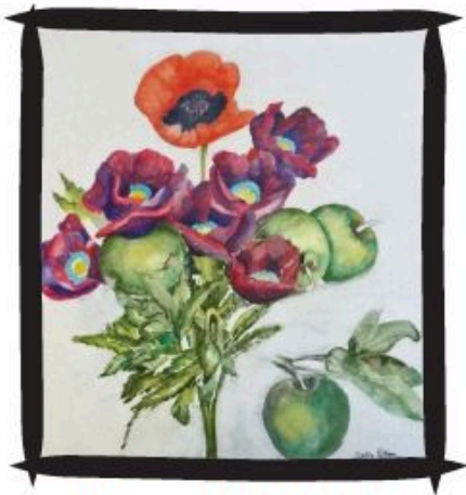
Honorable Mention by: Sally Patten