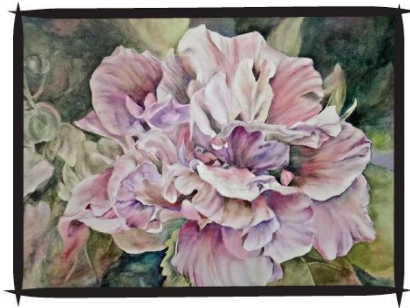
Diana Day Glynn