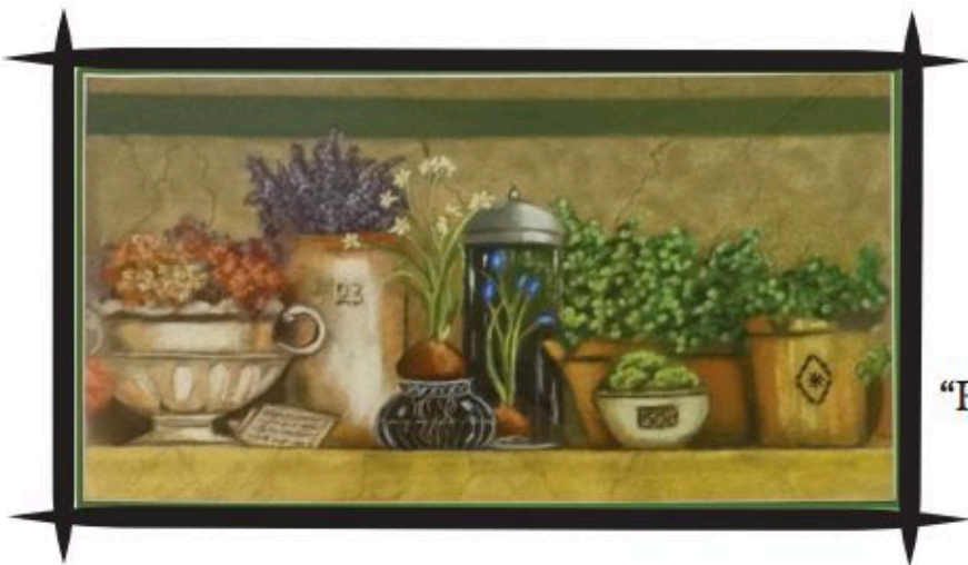
Third Place "Potting Shed" by: Pat McMorrow