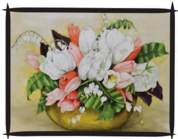
First Place & Popular Choice "Brass Bowl" by: Pat Barr