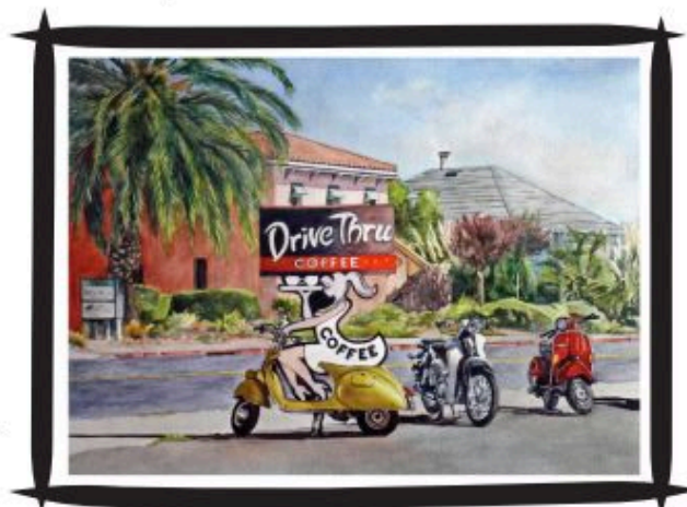
"Cafe Scooteria" by: Diana Day Glynn