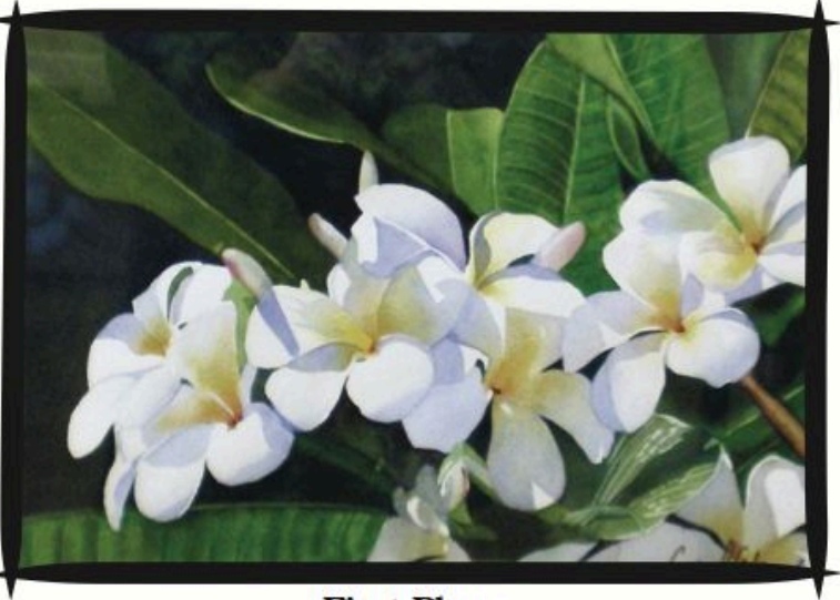
First Place "Plumeria" by: Carmel Adams