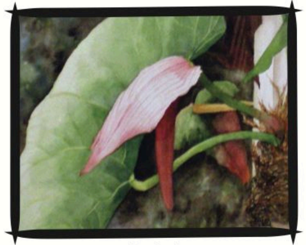
Third Place "Bouquet" by: Pat Barr