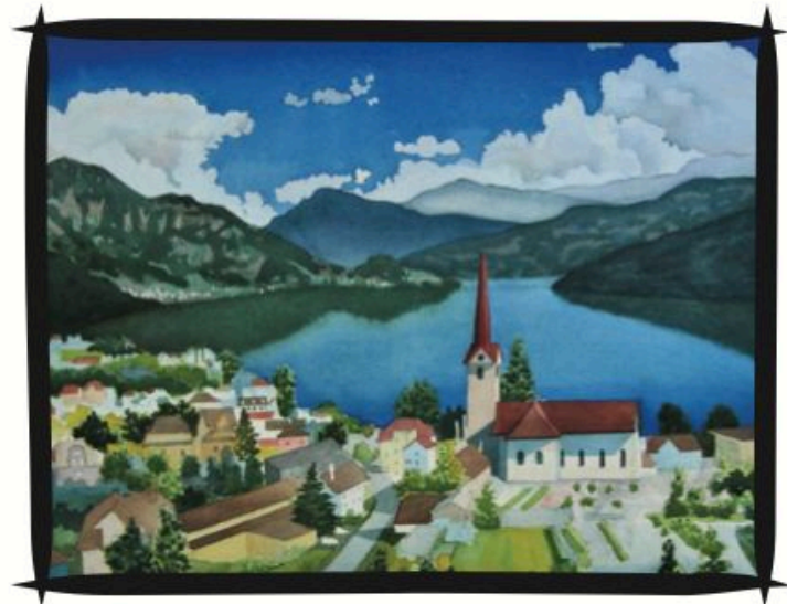
Second Place & Popular Choice "Weggis on Lake Lucern" by: George Dumanden